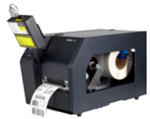
Online Data Validator (ODV)