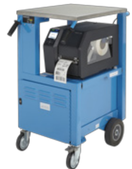
Powered Mobile Print Cart