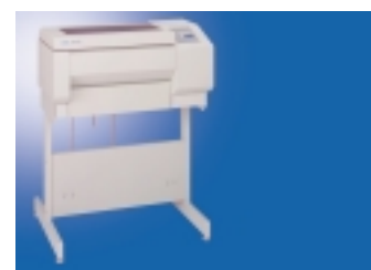
T6100 Open Pedestal