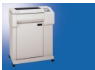
T6100 Enclosed Pedestal