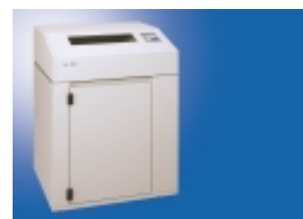
T6101 Quietized Cabinet